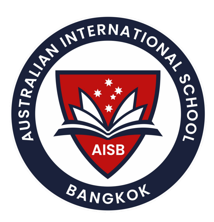
Updated Logo From Nov 2024 onwards